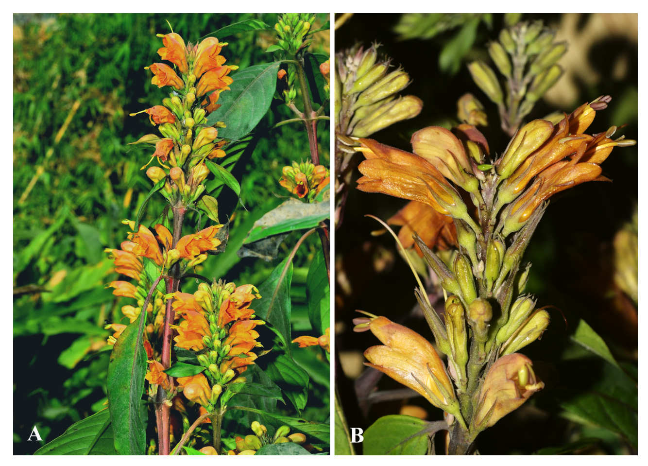
FIGURE 1. Phlogacanthus jenkinsii C.B.Clarke A. Habit, B. Inflorescence close up.

Phlogacanthus jenkinsii C.B. Clarke (1885: 511) [Figs. 1,2].