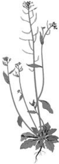
Figure 7.35 Arabidopsis thaliana , small annual herb from family Brassicaceae, whose genome is most completely known among the angiosperms, is aptly known as the guinea-pig of plant kingdom.